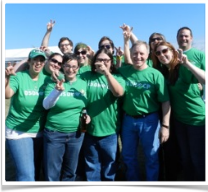
Comm Department Homecoming Tailgating Event. We had a great time with some sun, fun and football for this event. It is a time for us to get together with our students and Alumni to cheer on our Mean Green Eagles!