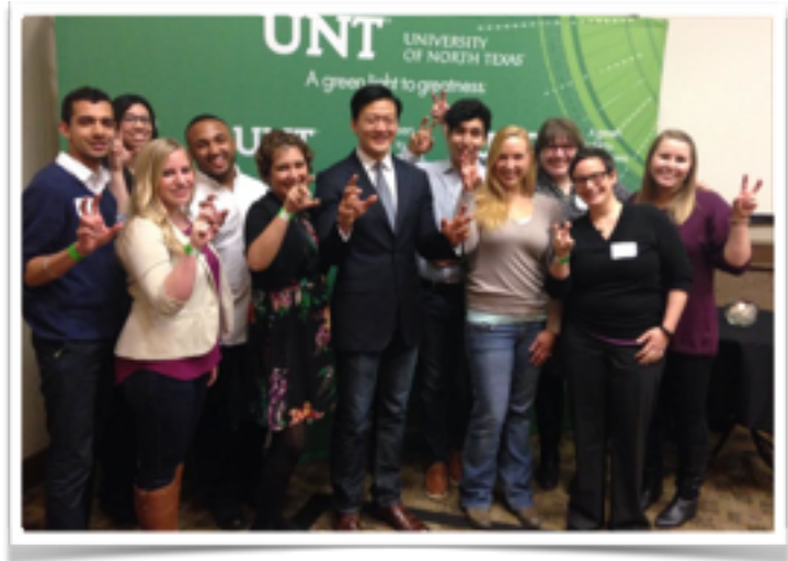
UNT Department of Communication Studies representing at the Lt. Dan Choi Distinguished Lecture Series.