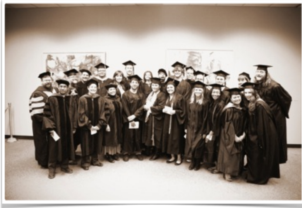
Fall 2013 Hooding & Senior Recognition Ceremony