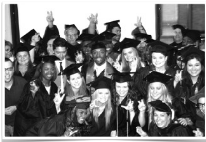
Spring 2014 Hooding & Senior Recognition Ceremony